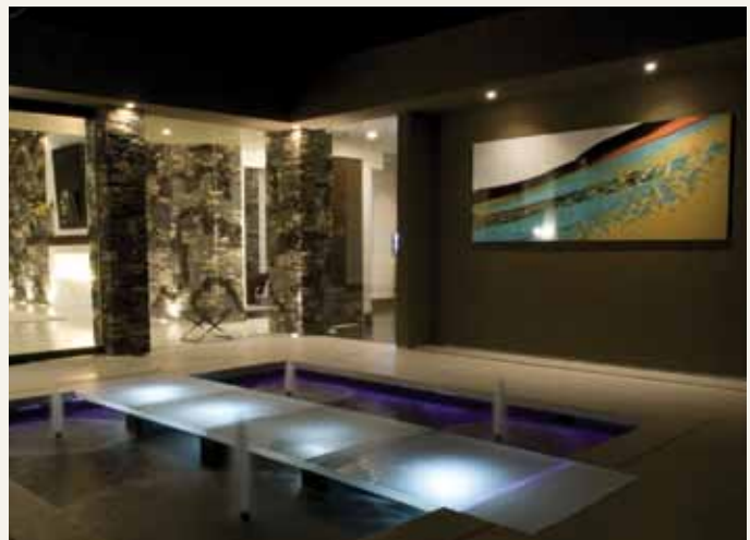
“Oneness” 4’ x 10’ outdoor piece printed on aluminum