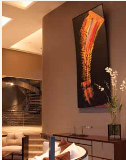
“essenZe” 9’x 4’ original, acrylic on metal

Sophisticated. Sensual. Contemporary. Alive! Pamela Nielsen’s Contemporary Art deZigns captivate your senses with unequaled color combinations, texture, emotions and movement.