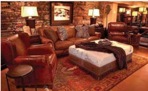
Hancock and Moore Leather