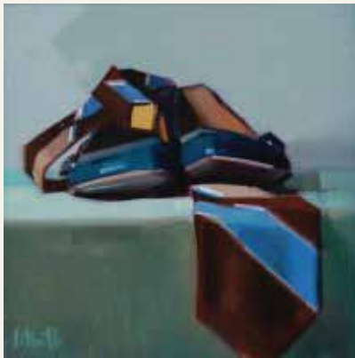
After the Show